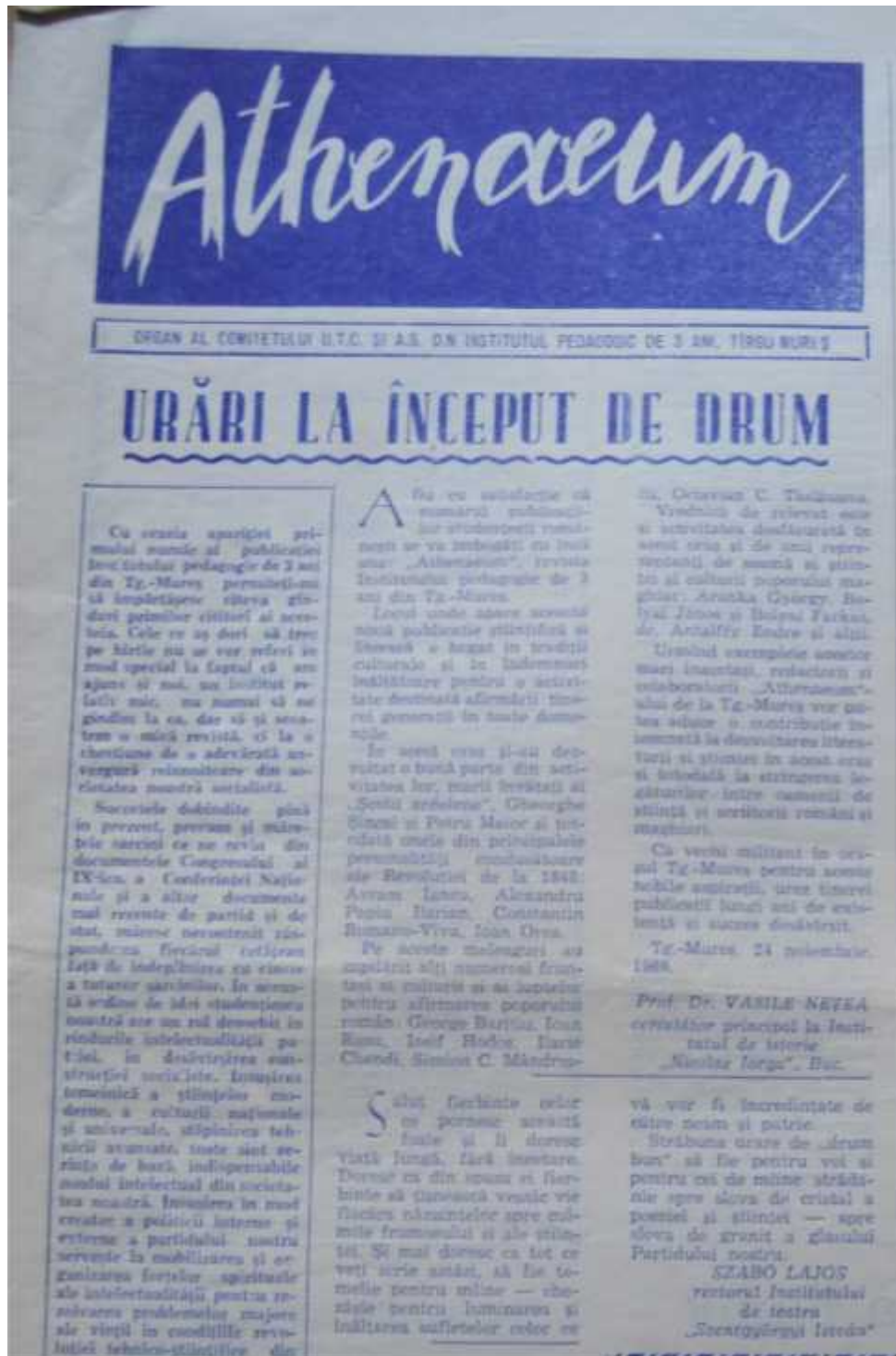
Figure 3. Athenaeum (1968-1972), the publication of the 3 years Pedagogical Institute in Târgu-Mure during the communist period.